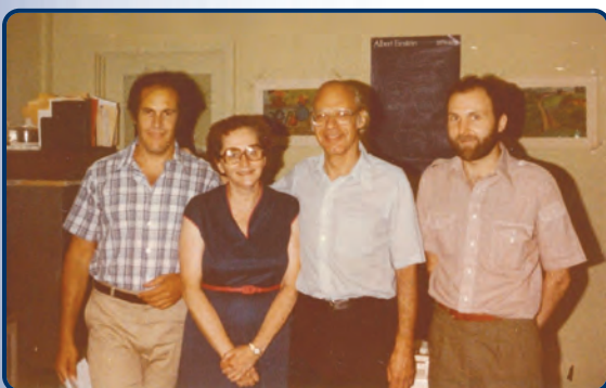
The editorial team at the Princeton University Press. (1982)